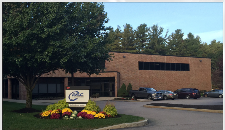
Corporate Headquarters - Canton, MA