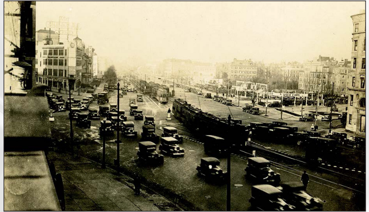
Kenmore Square Site of original Bearings Specialty location